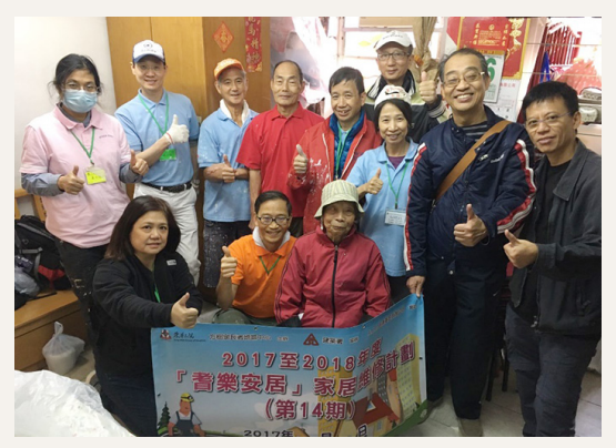
Painting Programme for the Elderly