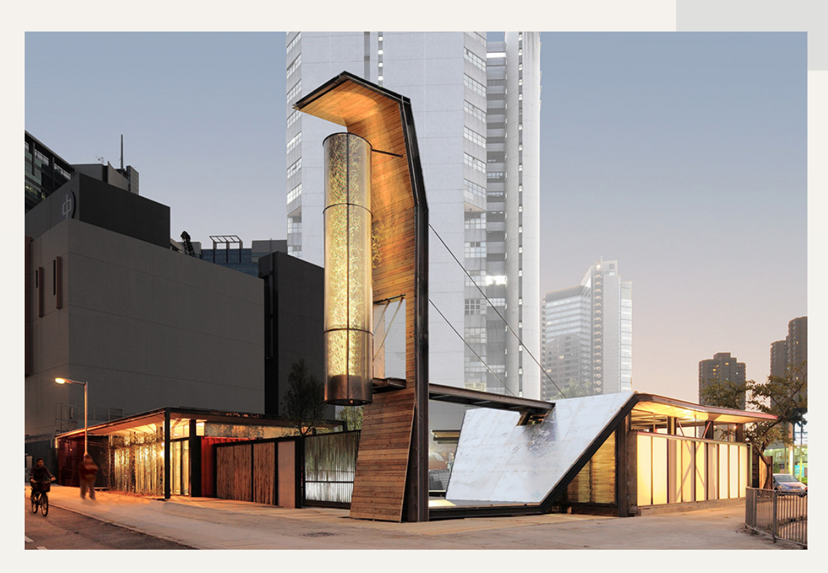
Community Green Station at Shatin

The Architizer A+Awards is organised by Architizer.com, the largest online community of architects, with an aim to nurture the appreciation of meaningful architecture in the world and champion its potential for a positive impact on everyday life. Two of our projects "Hong Kong East Community Green Station" and "Shatin Community Green Station" were recognised as 2017 Finalists.