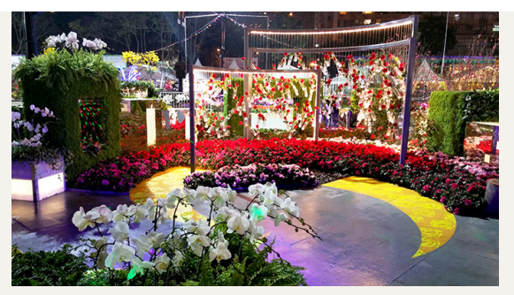
ArchSD flower display in the Hong Kong Flower Show