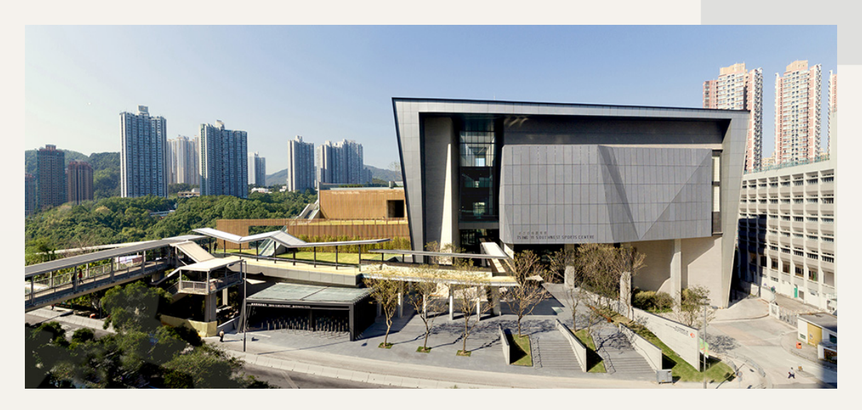
Tsing Yi Southwest Sports Centre