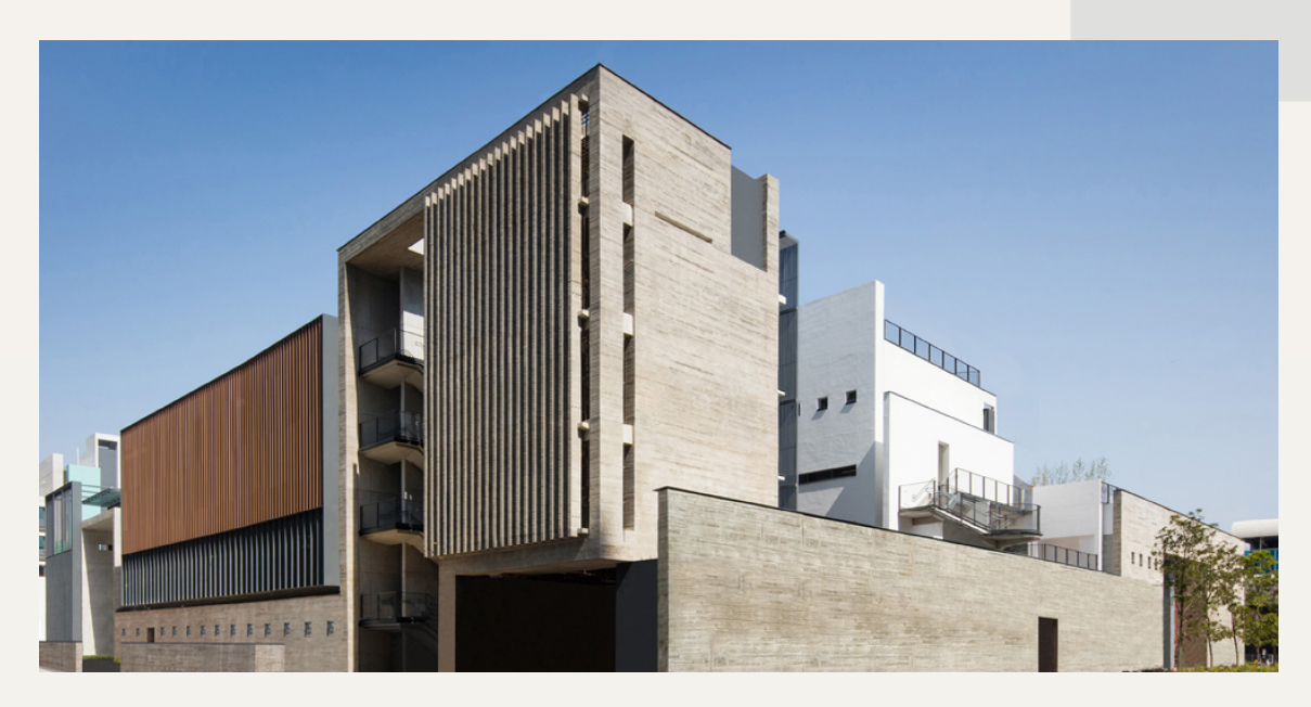
P.L.K. Stanley Ho Sau Nan Primary School