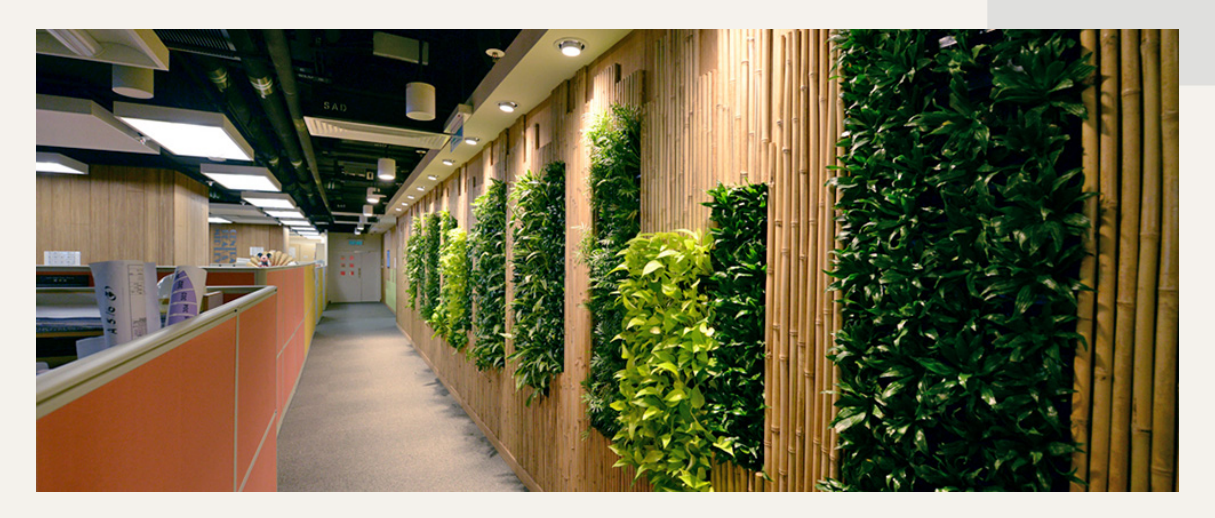
Renovation of APB Centre 1/F