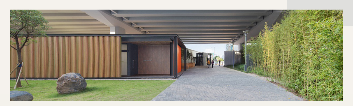
Hong Kong East Community Green Station