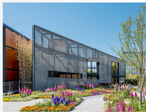
'Hong Kong Garden' in the Beijing International Horticultural Exposition

The Best Contribution Award & Silver Award for Chinese Outdoor Garden