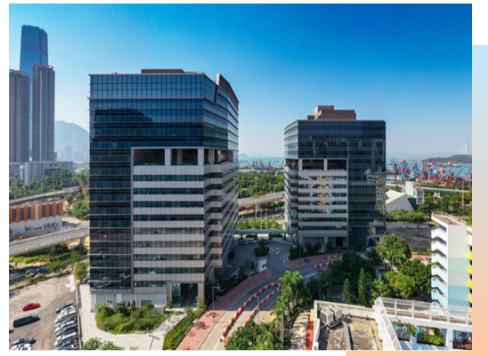
West Kowloon Government Offices

Excellence Award for Inclusive Environment