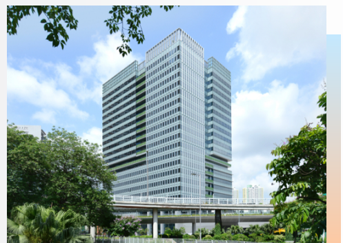
The Trade and Industry Tower in Kai Tak Development Area

Winner – Project of the Year Awards - Public Use Building