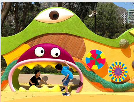
Tuen Mun Park Inclusive Playground

The Civil Service Bureau has been organising the Civil Service Outstanding Service Award Scheme on a biennial basis to recognise the departments and teams that provide excellent service and promote the customer-oriented culture in the civil service. The Inter-departmental Partnership Award is one of the awards under the Scheme, commending bureaux and departments that have succeeded in achieving notable service enhancement through collaboration. In 2019, we were honoured to have our 'Tuen Mun Park Inclusive Playground' project receiving the Silver Prize together with Leisure and Cultural Services Department.