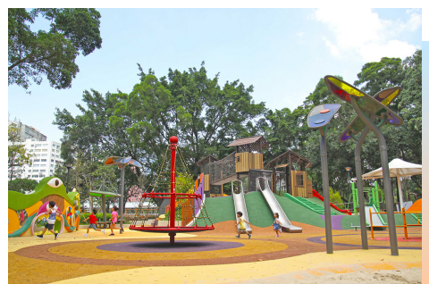
Tuen Mun Park Inclusive Playground

Special Architectural Award – Inclusive Design