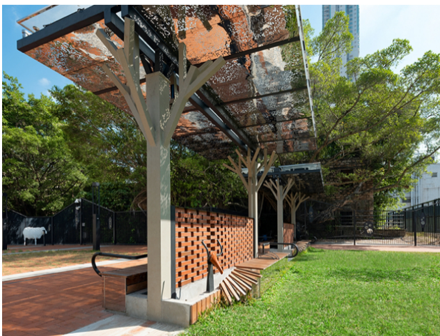
Sitting out areas surrounded by open green areas