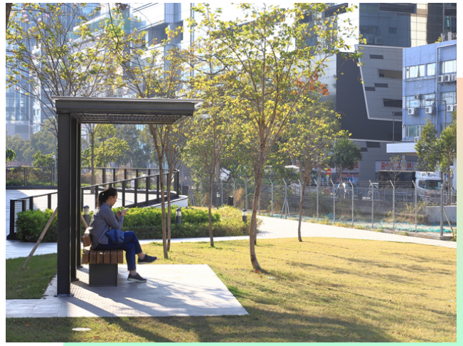
Sitting-out area with shelter