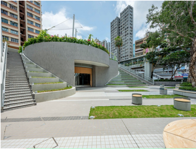
A podium garden with landscape plants to create urban greenery