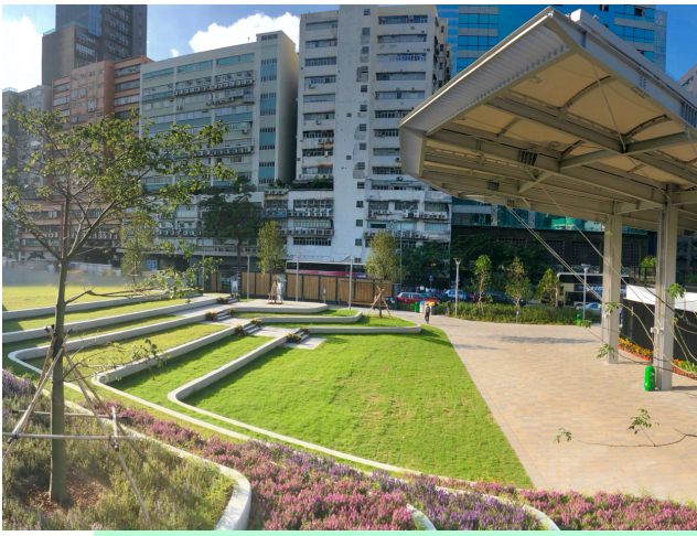
A multi-purpose area for organising public activities and events