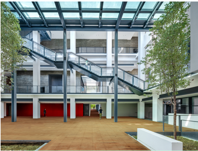
The glass floor on top of the central courtyard provides natural light into the public gathering place