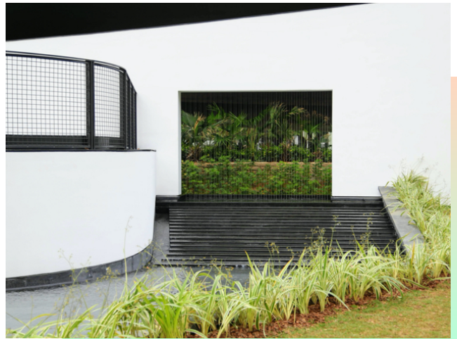
Featured lawn areas with landscape plants