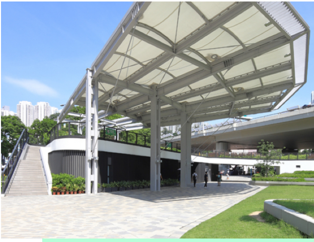
A large rain shelter