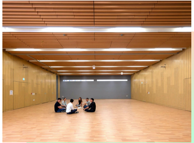
A large indoor activity room that is adjacent to the inverted cone, providing areas for organising different community activities and social gathering