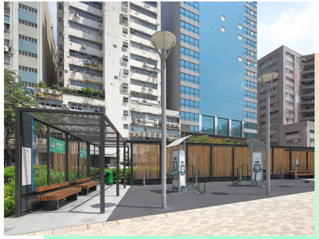
Elderly fitness area