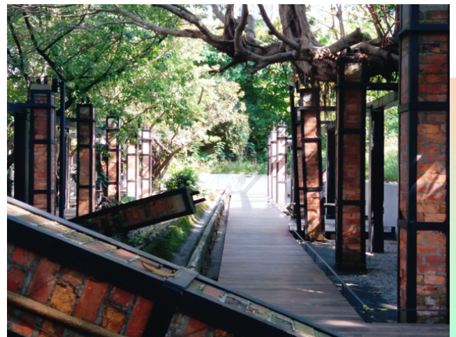
Open space for community leisure use