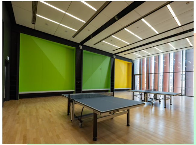
The community hall provides a performance venue and recreational space for the locals