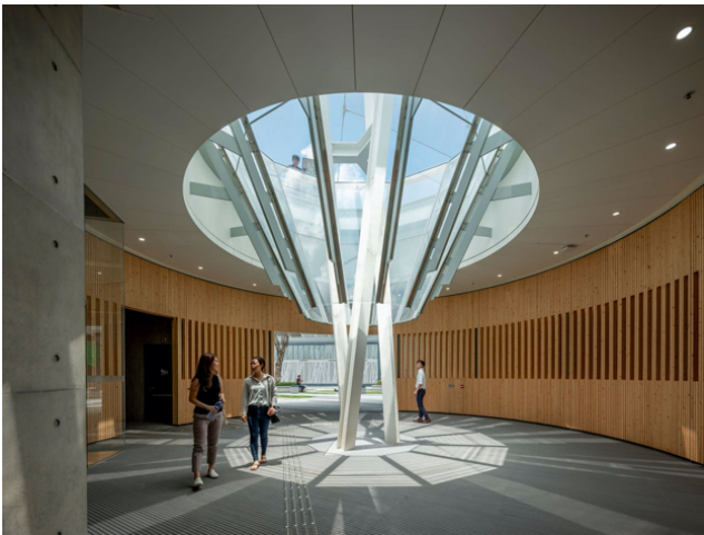
A central open inverted cone in the covered interior space that facilitates natural ventilation and lighting, creating comfortable indoor environment for the building users