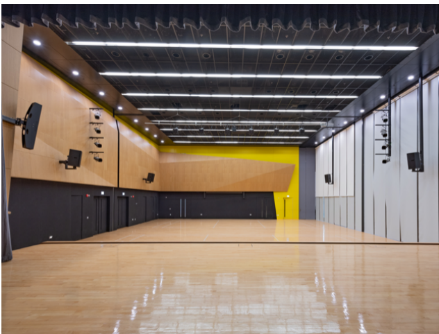
Full height curtain wall is adopted in the external envelope and internal atrium to maximise the penetration of daylight into recreational area