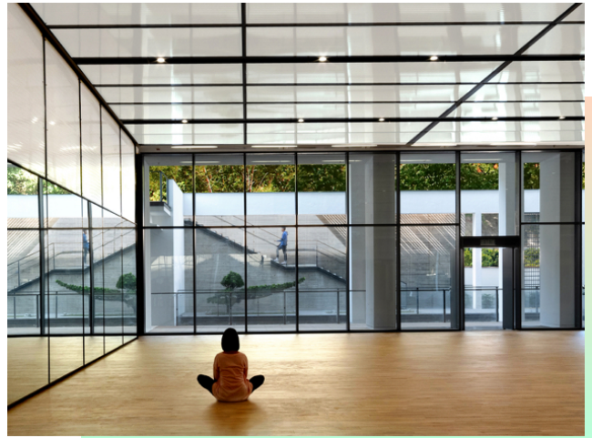
The use of windows captures the outdoor green landscape