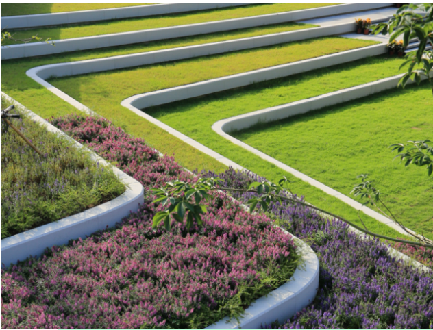
Featured lawn areas with landscape plants