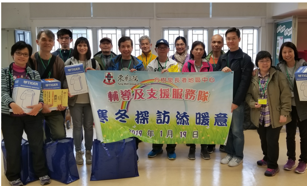
A visit to the Elderly Home