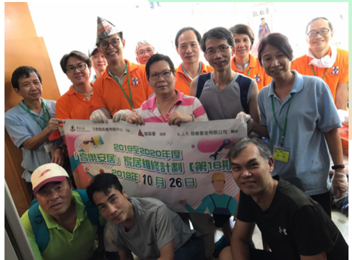
'Redecoration of Homes of the Elderly'