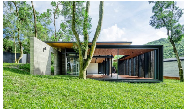
HOI HA VISITOR CENTRE

The HKIA Annual Awards aims to give professional recognition to outstanding architectures. During the year, we were pleased to have the following projects receiving the Awards, including: