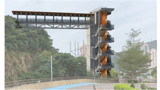
CONSTRUCTION OF A FOOTBRIDGE WITH LIFT TOWER TO CONNECT THE AP LEI CHAU WIND TOWER PARK AND AP LEI CHAU ESTATE