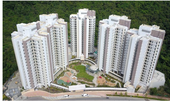
FIRE SERVICES DEPARTMENT PAK SHING KOK MARRIED QUARTERS

The Sustainability Construction Award is launched by the CIC in 2018. The Award honors best practices in sustainability among organisations and practitioners in the construction industry. Our project 'Fire Services Department Pak Shing Kok Married Quarters' is the first high-rise concrete MiC building in Hong Kong. The project showcased the benefits to our environment and construction productivity by using MiC, and was granted the Merit Award in 2020.