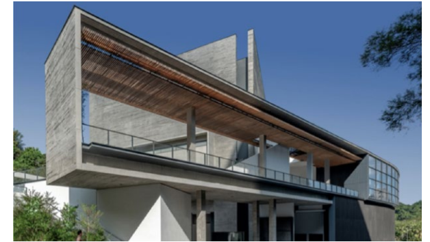
CHE KUNG TEMPLE SPORTS CENTRE

— Merit Award of Hong Kong – Community Building