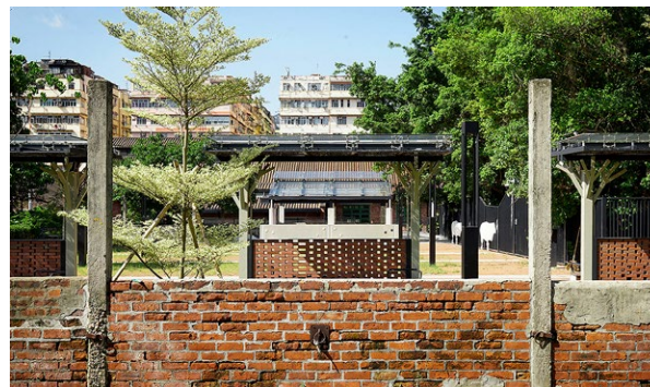
CATTLE DEPOT ART PARK

In 2020, the following projects were granted the Awards: