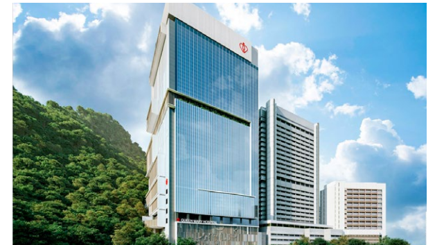
DESIGN AND CONSTRUCTION OF REDEVELOPMENT OF QUEEN MARY HOSPITAL, PHASE 1