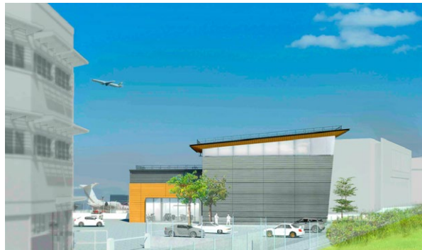
CONSTRUCTION OF FLIGHT SIMULATOR TRAINING CENTRE OF THE GOVERNMENT FLYING SERVICE ITEM