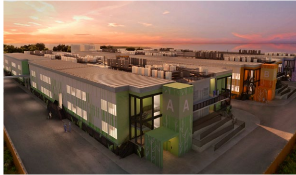
NORTH LANTAU HOSPITAL – HONG KONG INFECTION CONTROL CENTRE

As announced in April 2021, ArchSD earned the following awards: