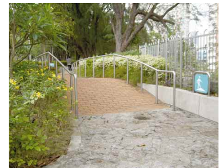
4.1i Travel experience enhanced by undulating pathways and floral planting