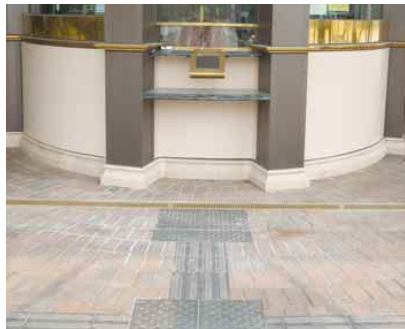
4.1d Access to information and services led by tactile guide paths