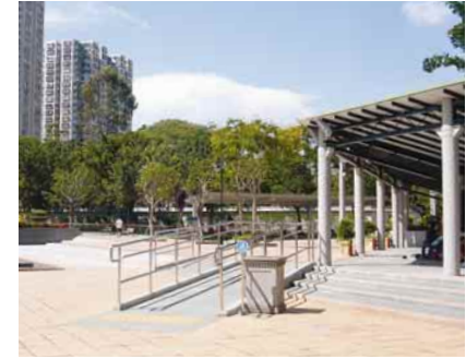
4.1c Accessible ramp at change in levels in an open space