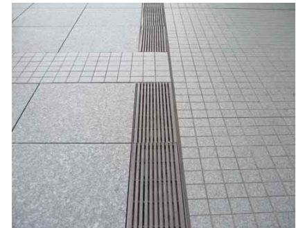
4.1f Channel grating arranged perpendicular to the travel path and with slots less than 13mm wide