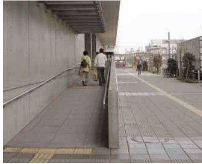
4.1a Unobstructed access routes with tactile guide paths in contrasting colours to the surrounding flooring finishes