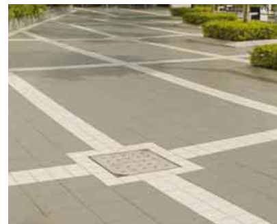
4.1h Surface drainage with floor drains — floor surface generally levelled and the drain cover flush with the surrounding flooring finishes