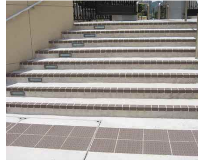
4.1b Access stair with adequate warnings — provision of tactile warning strips and contrasting nosing on steps