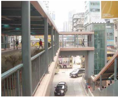
4.2j Accessible lift to facilitate access at footbridge connection