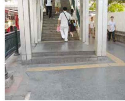
4.2b Tactile guide path leading to vertical connection