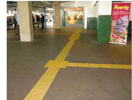
4.2f Tactile guide path leading to different transportation modes