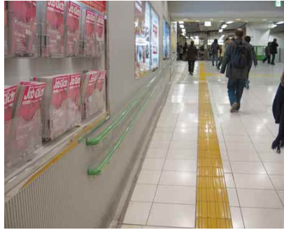
4.2a Tactile guide path and double handrails to facilitate access at subway connection