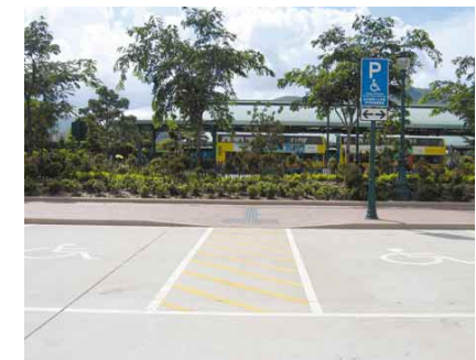
4.2i Accessible connection from car parking facility