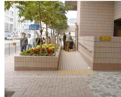
4.2e Accessible lift to facilitate access to different levels of external areas