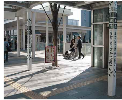
4.2k Urban plaza with tactile guide path and signage leading to various facilities