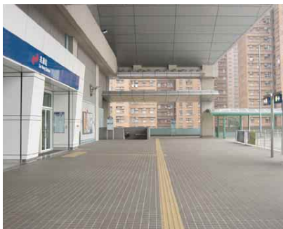
4.2r Clear and unobstructed access connection to transport facilities