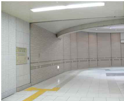
4.2n Tactile directory at subway junction led by tactile guide path