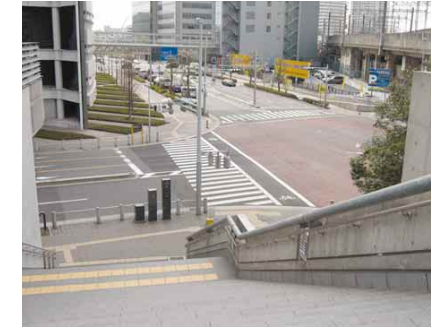
4.2c Tactile guide path leading to major connection points