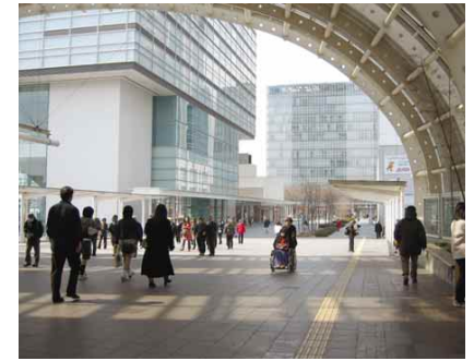
4.2m Wide and levelled walkways with continuous tactile gride path at junction between external and covered areas