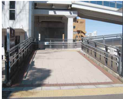
4.2d Wide connection ramp with tactile warning strips and multi-level handrails