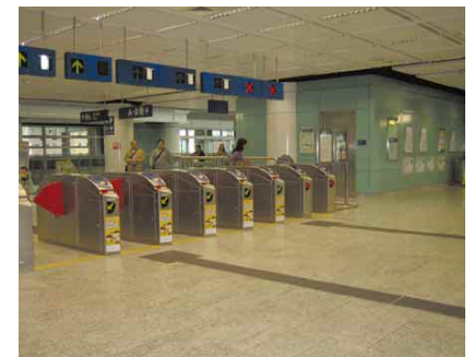
4.2t Continuous access to transport services