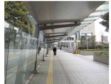
4.2q Wide covered walkway with continuous tactile guide path