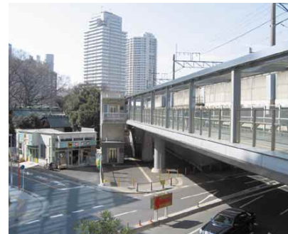
4.2p Accessible connections with continuous tactile guide path