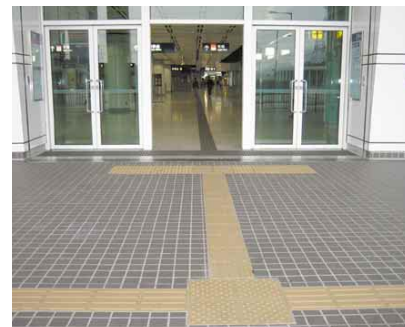
4.2s Continuous access from external to internal areas