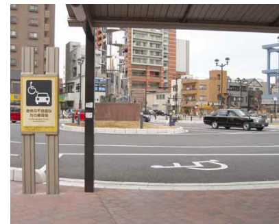
4.2h Designated accessible pick up/drop off point identified by clear signage