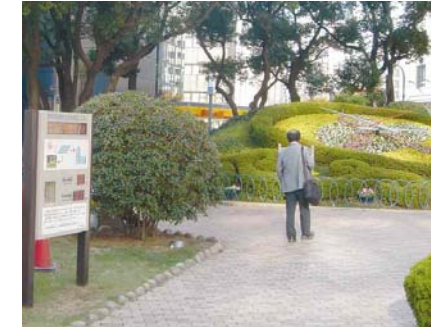
4.3c Flower Clock landscape feature with low-lying herbaceous plants arranged on an inclined plane forming a strong focal point and conveying a sense of time passage