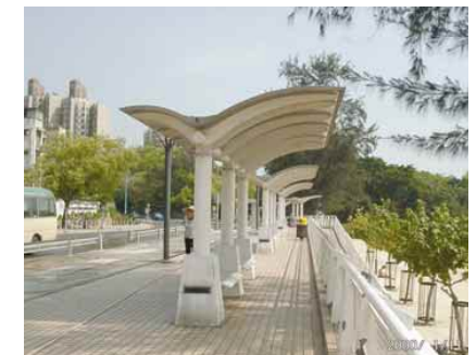
4.3i Sheltered seats strategically located on top of the ramp to provide visual accessibility to the beach and pleasant sea views