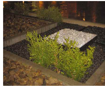
4.3p Thoughtful design using planting and pebbles along edges of a reflective pool to enhance safety at the transitional space