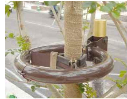
4.3m Staking of roadside trees without any sharp edges or unexpected protrusions