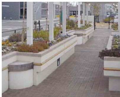
4.3g Specially designed planters for horticultural therapy facilitate appreciation of low-lying herbaceous plants at an accessible height