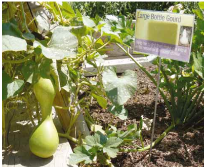
4.3j Special planting features integrated with accessible signage for education purposes