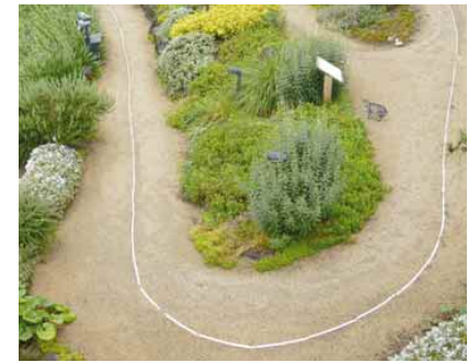
4.3q Tactile clues provided along an accessible ramp that meanders through a landscaped area