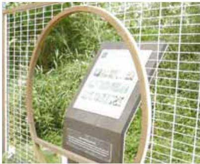
4.3n Interpretive signage integrated into the landscape design