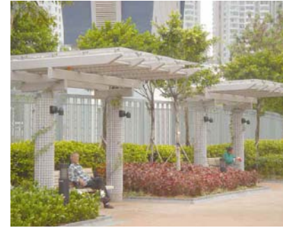
4.3b Accent planting with colourful foliage located near sheltered seats with wheelchair space to draw visual attraction