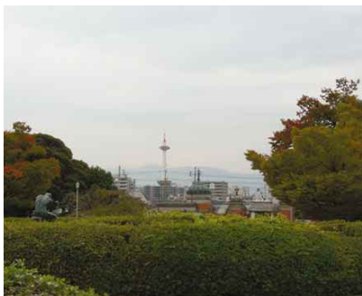
4.3r Good landscape planning integrating vegetation with natural landform to frame views and offer visual accessibility to "borrowed scenery" down the hill