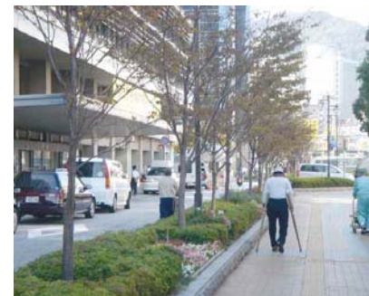
4.3h Street trees planted in appropriate spacing and properly maintained allowing both physical and visual clearance at strategic locations