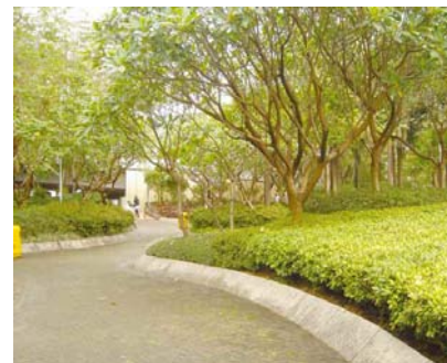
4.3s Low-branching trees planted with appropriate setback from the kerb line to ensure physical clearance on the passageway