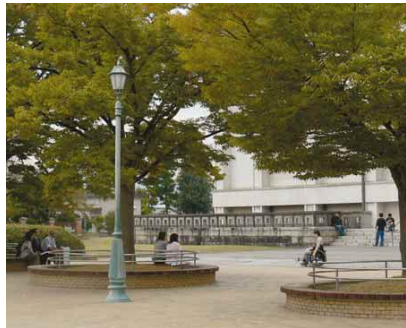
4.3d Thoughtful design that incorporates seating under shade while providing root protection zone for preserved trees