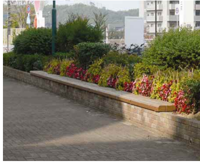
4.3a Buffer planting with colourful blossom and foliage located next to seating bench to facilitate visual enjoyment