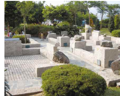
4.3e Landscape theme with accessible outdoor display of mineral rock specimens, tying in with the local history