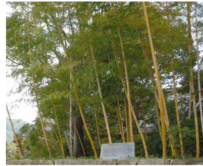
4.3k Large plant labels convey information effectively and facilitate comprehension