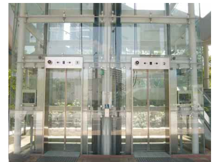
4.8t Transparent lift shaft and lift car for natural lighting during daytime and spill-over of internal light to external areas at night