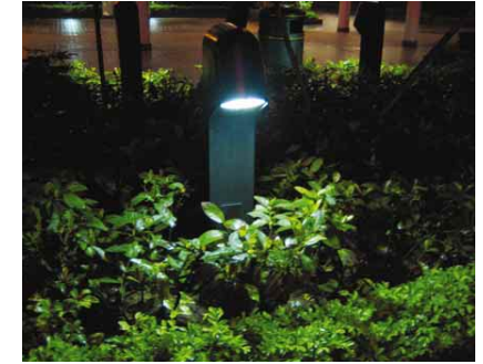
4.8c Low level shielded down light for planter