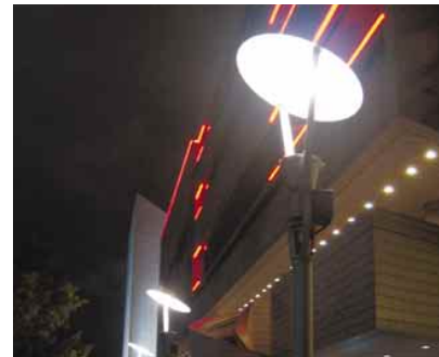
4.8p Lamp pole using reflective light