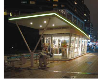
4.8b Lighting for canopy edge and interior light spilling-over to the external, minimizing the need for façade lighting