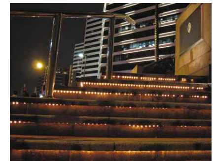
4.8i Lighting at risers