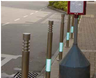
4.8n Roadside bollards with reflective strips for easy identification