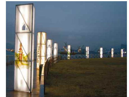
4.8f Vertical pillar light boxes illuminate the path and also serve as display features