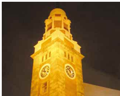
4.8g Clock tower illuminated as a landmark feature