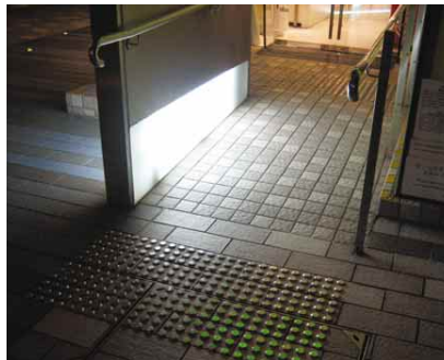
4.8d Low level side light for ramp