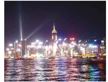
4.8m Light show in a clear dark sky, with no lamp poles or obstructions along the waterfront