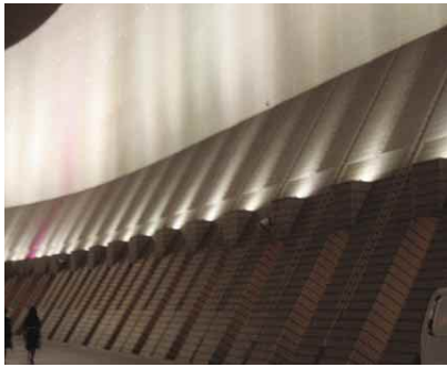
4.8j Façade lighting from above eye level