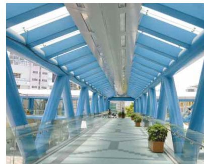
4.8s Footbridge with skylight and a row of artificial lighting along the centre