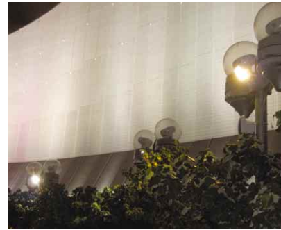
4.8k Special effect lighting mounted on poles located in planters