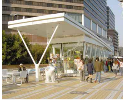
4.8a Daytime pavilion lit up with natural light