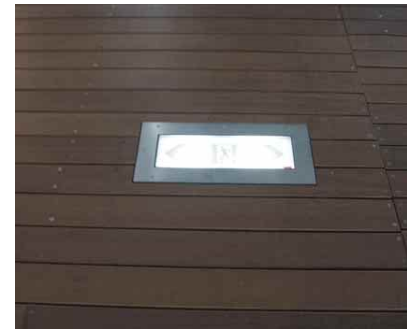
4.8e Illuminated floor mount directional exit sign levelled with the surrounding floor finish