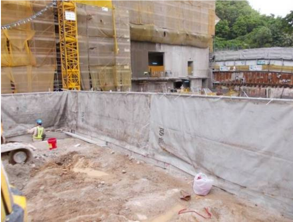
Noise barriers are erected during ground breaking and drilling 豎立隔音屏障以減低破碎及鑽孔噪音 竖立隔音屏障以減低破碎及钻孔噪音