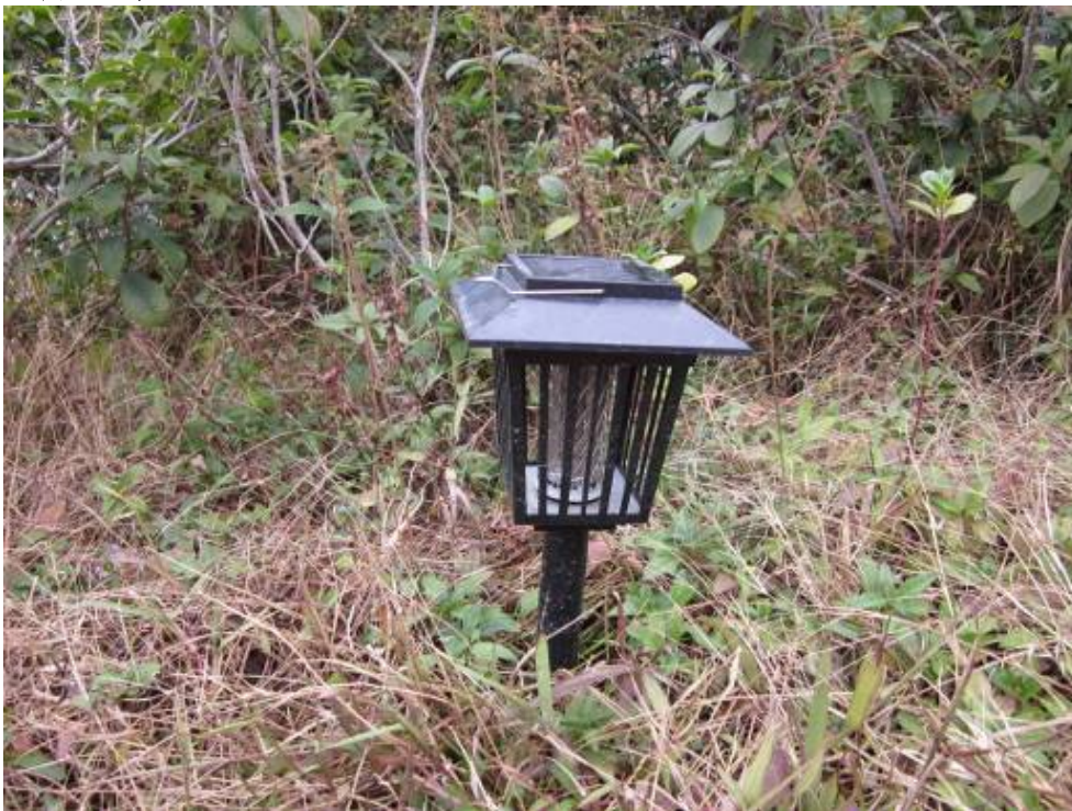
Solar mosquito killer