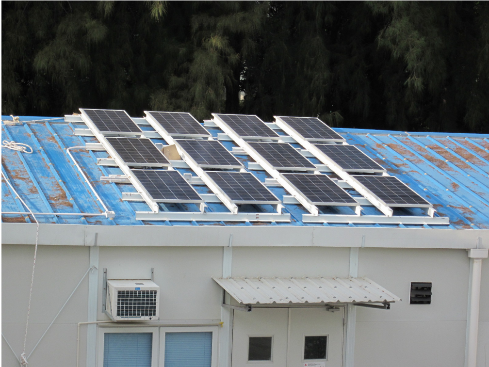
Install the Solar panels as renewable energy source 安裝太陽能電池板 安装太阳能电池板