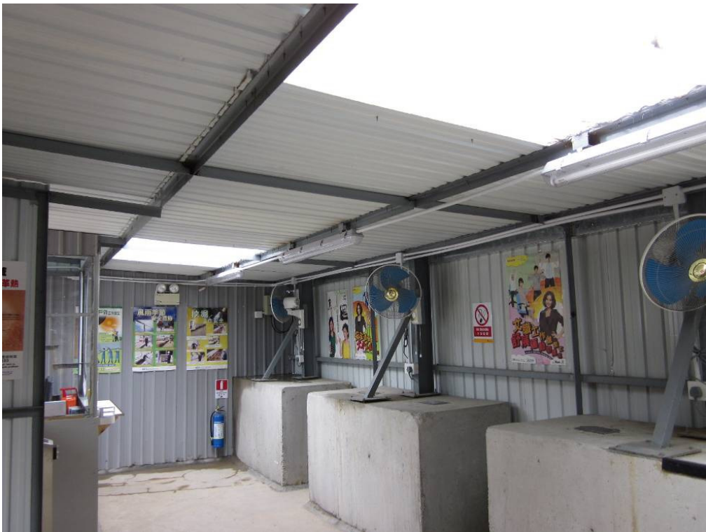
Transparent Sunroof for Energy Saving 透明天窗可引進自然光以達到節能目的 透明天窗可引进自然光以达到节能目的