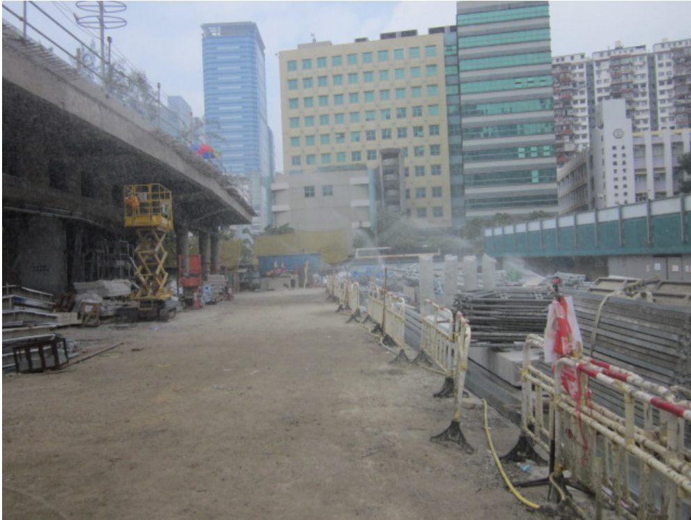
Installation of mist system for dust suppression