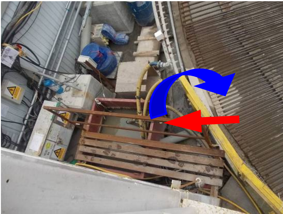
Wheel-washing water are recycled and reused to reduce the consumption of water. 洗車污水會被回收及重用，以減少水的消耗 洗车污水会被回收及重用，以減少水的消耗