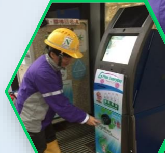
1. Code Screening