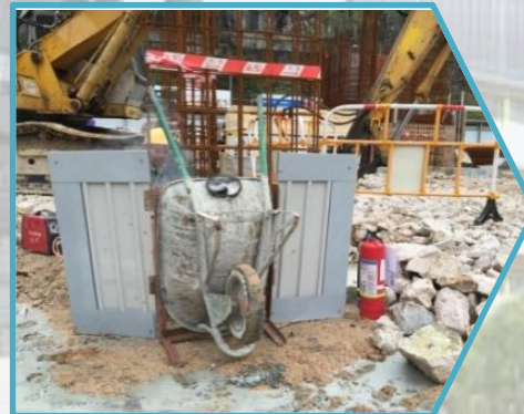
2 nd Generation