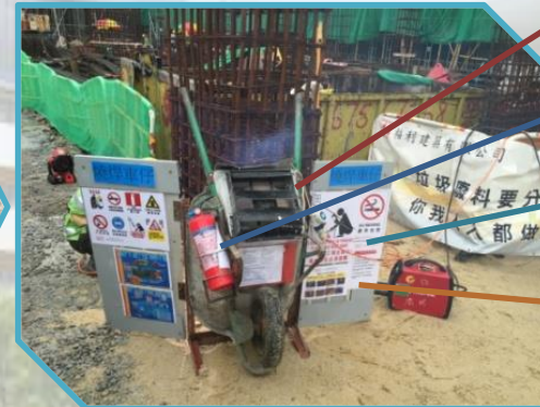
3 rd Generation