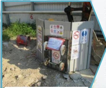
1 st Generation