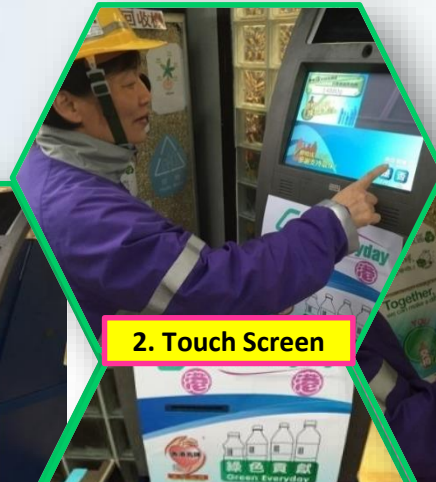
2. Touch Screen