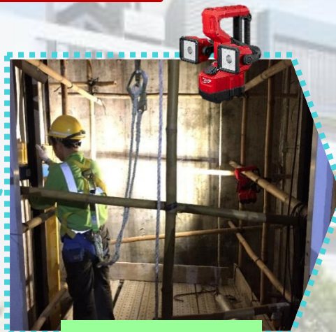
Lift shaft works