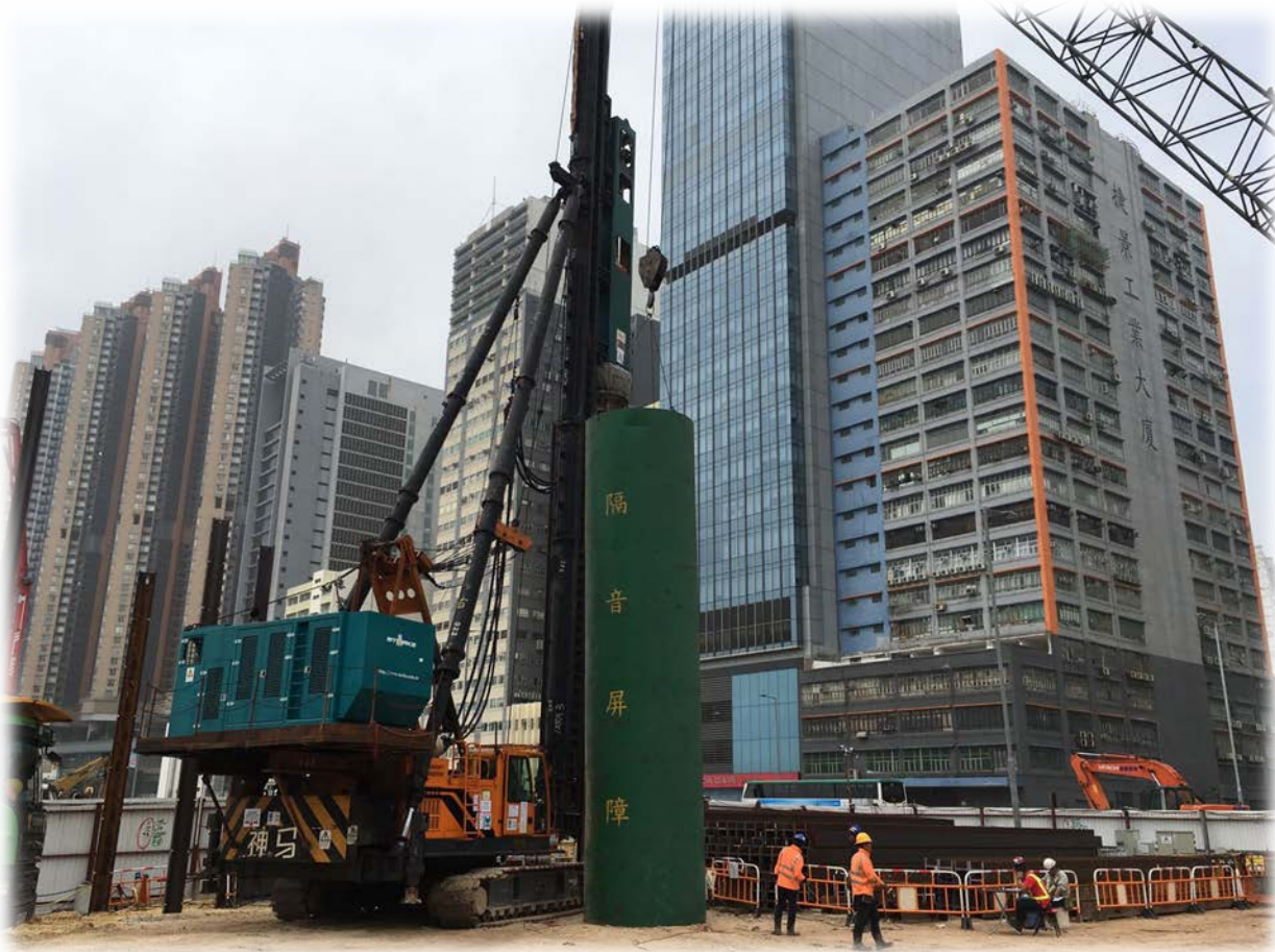
Noise enclosure used for piling work , able to reduce 15 dB(A) (Measured by certified lab)