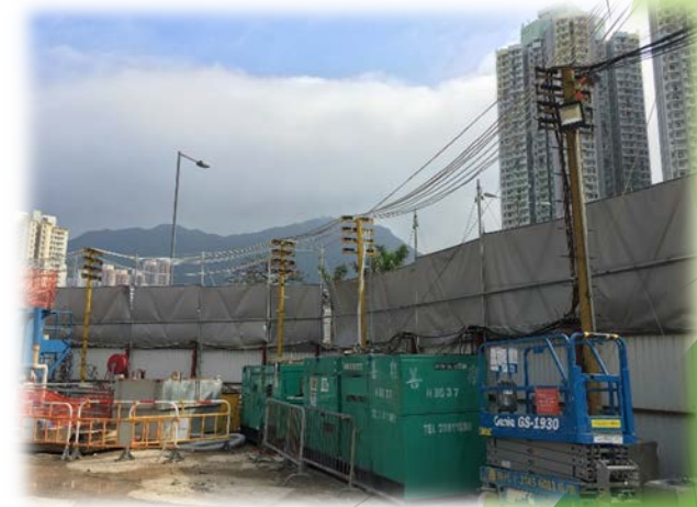
Acoustic screen erect at site boundary