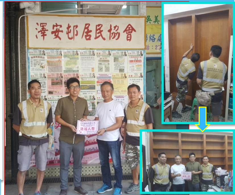
Resident committee office at Chak On Estate

Old wooden furniture in the construction site is revitalized : modified, tailor-made, upgraded and delivered to the residents' who needs them