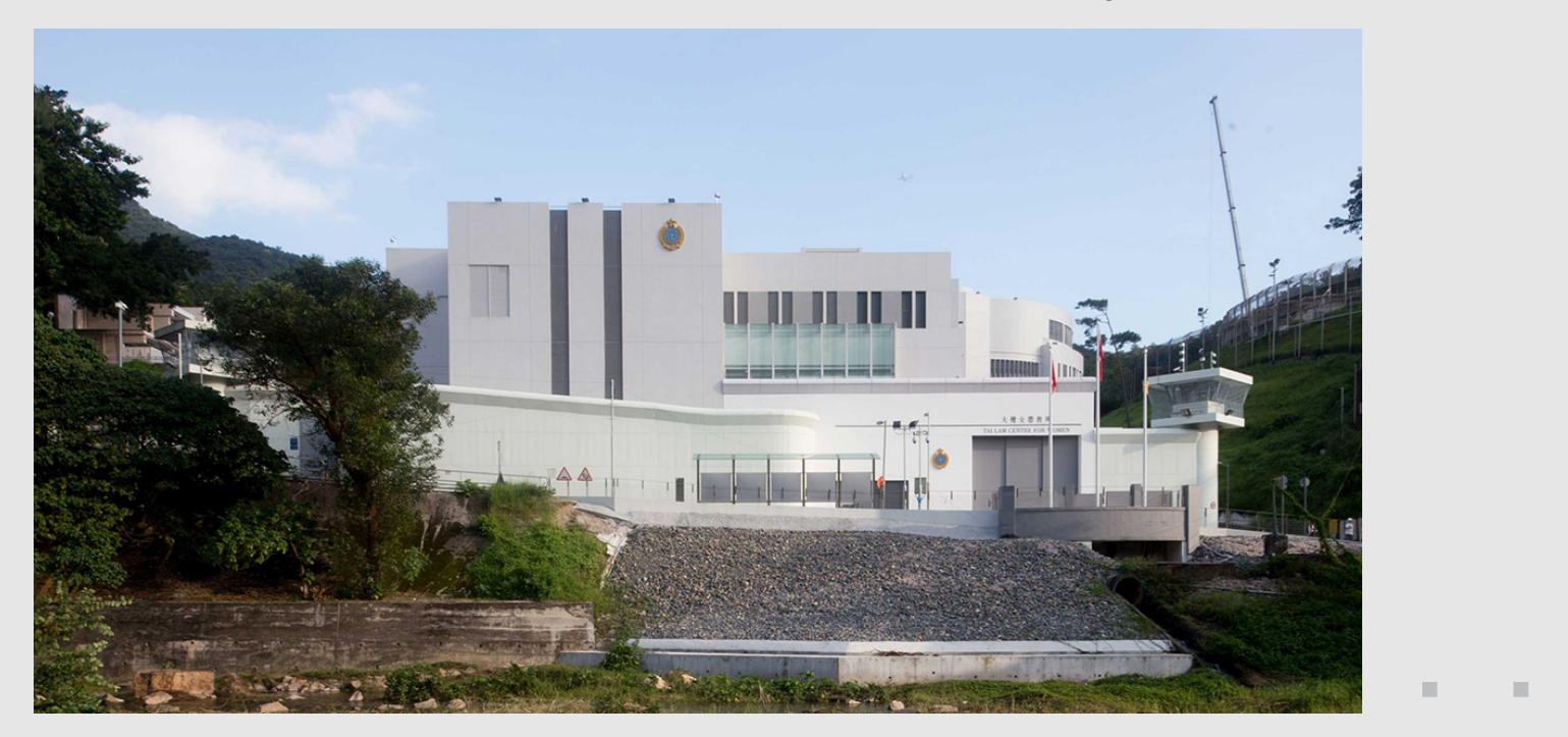
Redevelopment of Tai Lam Centre for Woman

The Main and East Wings of Justice Place