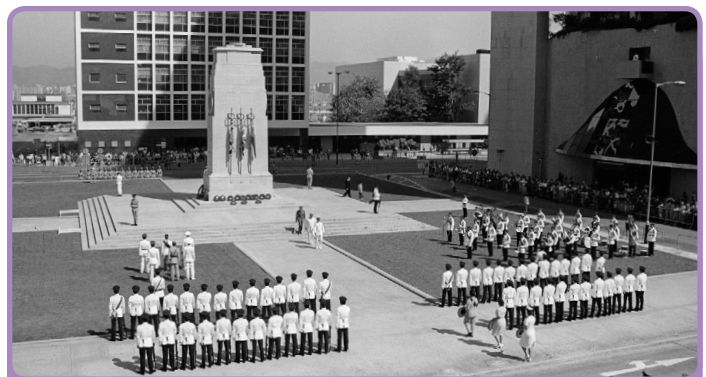
Cenotaph, with the High Block of the new City Hall at the background

The Statue Square was constructed in 1903 by private funding, and was the first and only civic space in the heart of Central. In addition to a square of statues, the Square provided a wide open space for all kinds of civic activities. The importance of the Statue Square remains unmatched throughout the years, and continues to be Hong Kong's most important and most representative public space.